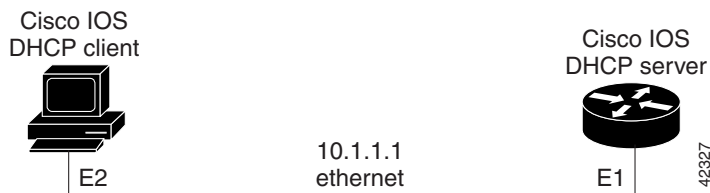
Figure 15 Topology Showing DHCP Client with Ethernet Interface

On the DHCP Server, the configuration is as follows: